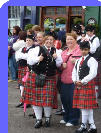
Cobh 03 June 2012

The following day 29th April, saw the band parade and perform in Kinlough, County Leitrim, Beleek, County Fermanagh, Boyle, Roscommon Town and Athlone, County Westmeath.