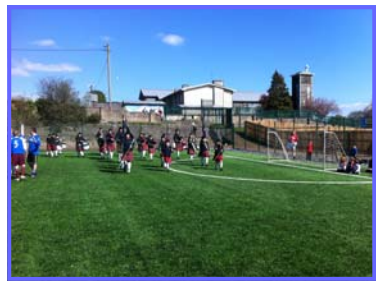
The official opening of Our Lady of Lourdes Parish Community Garden on 5th April again saw the band feature on the RTE television programme "Dirty Old Towns".

The Pan Celtic Solos (Southern Solo League 3) were held in Carlow Town on 14th April,