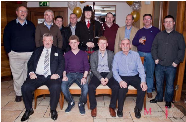
An "attitude" (collective noun) of Pipe Majors of the band over the years

As usual, March was to prove a busy month for the band with many parades and performances. Ardee, Carrickmacrosse, Armagh, Dungannon, Magherafelt, Toome and Newry, as part of the 32 County